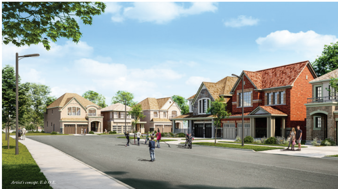
Artist's concept. E.&O.E.