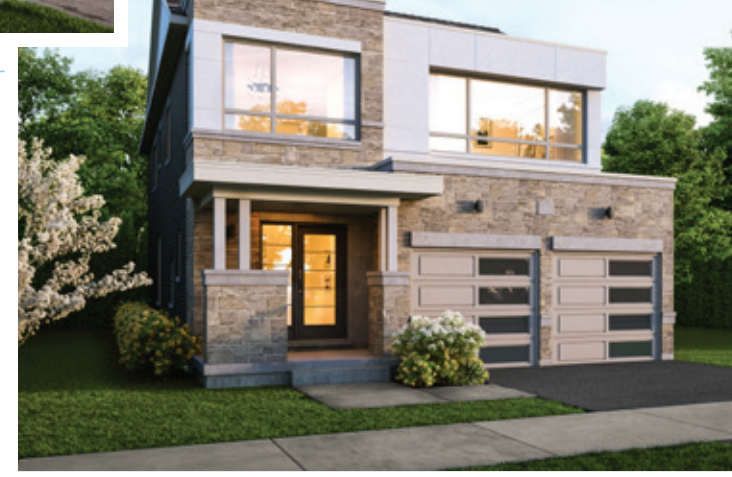
Elevation 'C' 2,580 sq. ft.