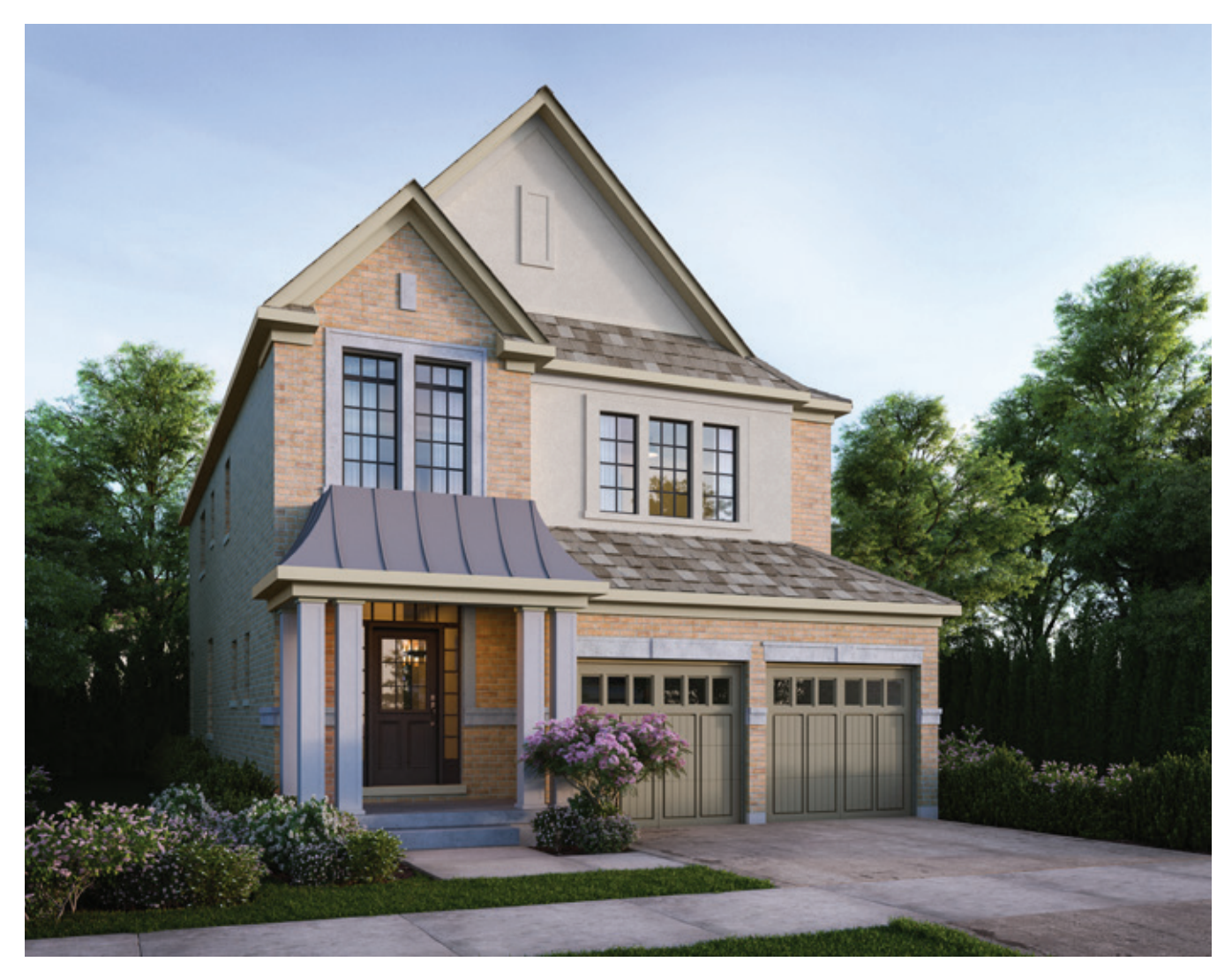
Elevation 'A' 2,590 sq. ft.