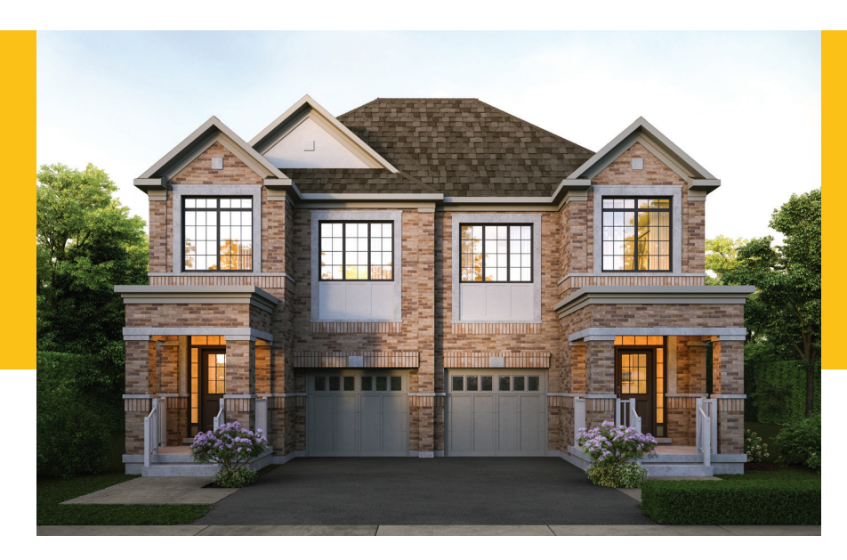
Elevation A - 2,620 sq. ft.

ALL ELEVATIONS INCLUDE 530 SQ. FT. OF FINISHED BASEMENT