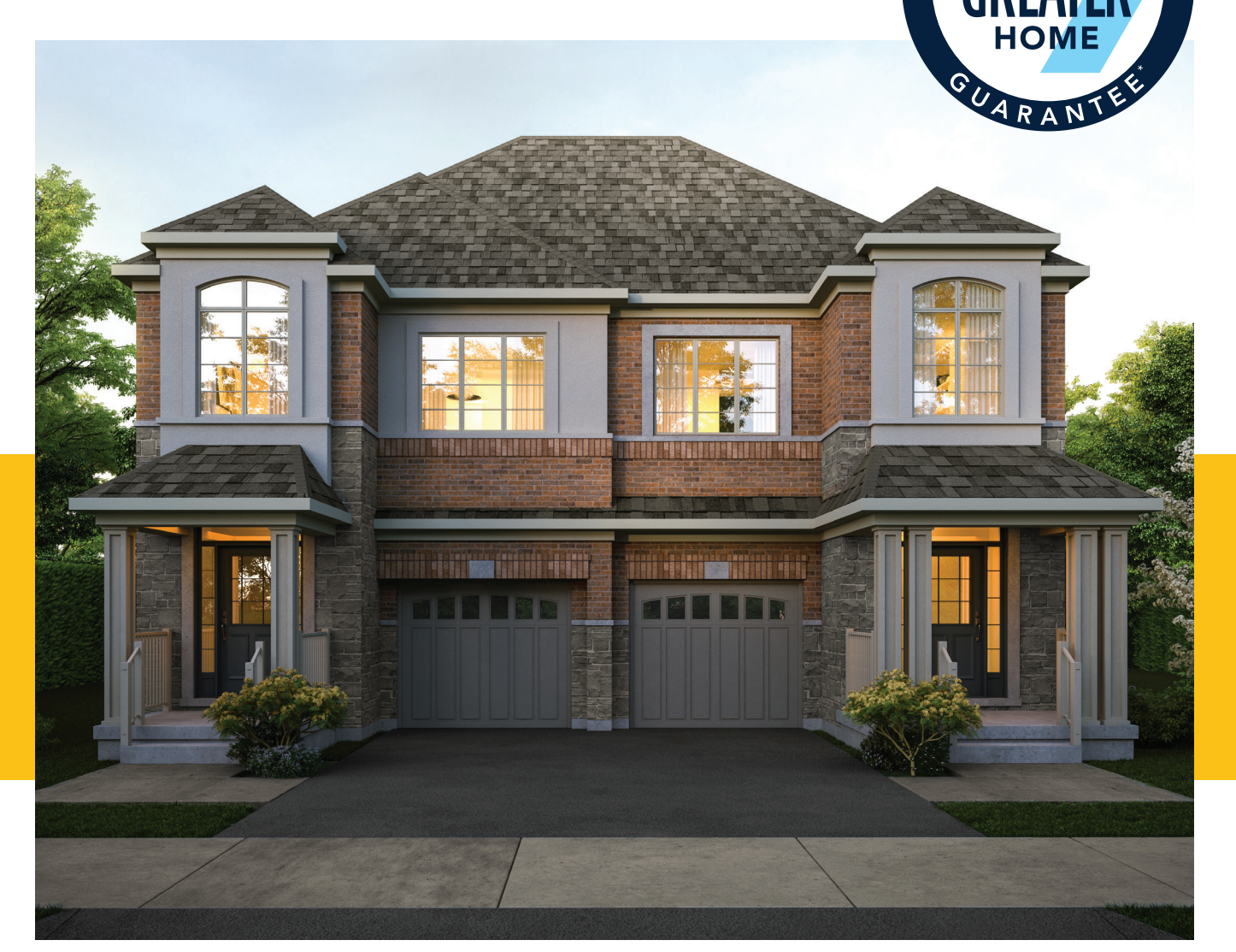
Elevation B - 2,610 sq. ft.