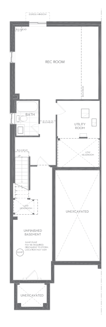
Basement - Elevation A