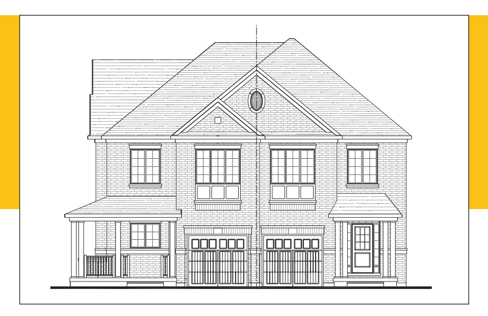
Elevation A - 2,535 sq. ft.

Elevation D - 2,555 sq. ft. INCLUDES 555 SQ. FT. OF FINISHED BASEMENT