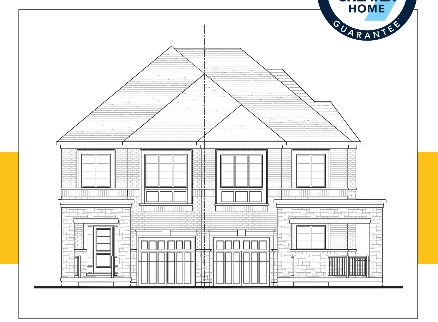
Elevation B - 2,425 sq. ft.

Elevation C - 2,460 sq. ft. Elevation D - 2,555 sq. ft.