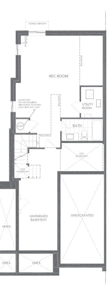
Basement - Elevation A