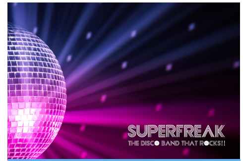
Live Music with Superfreak Band and Dance Performance by Lakeside Dance