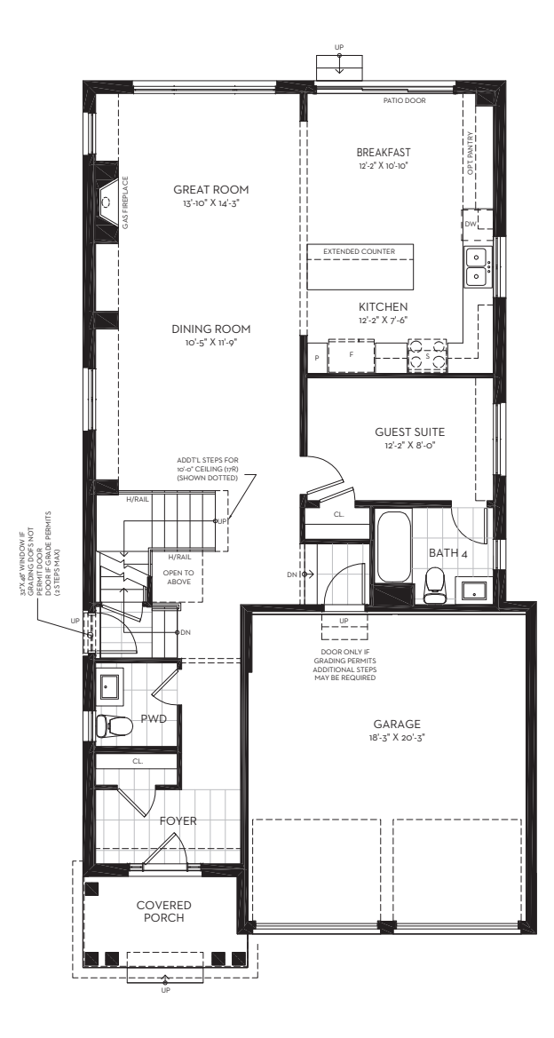
BASEMENT PLAN GROUND FLOOR PLAN