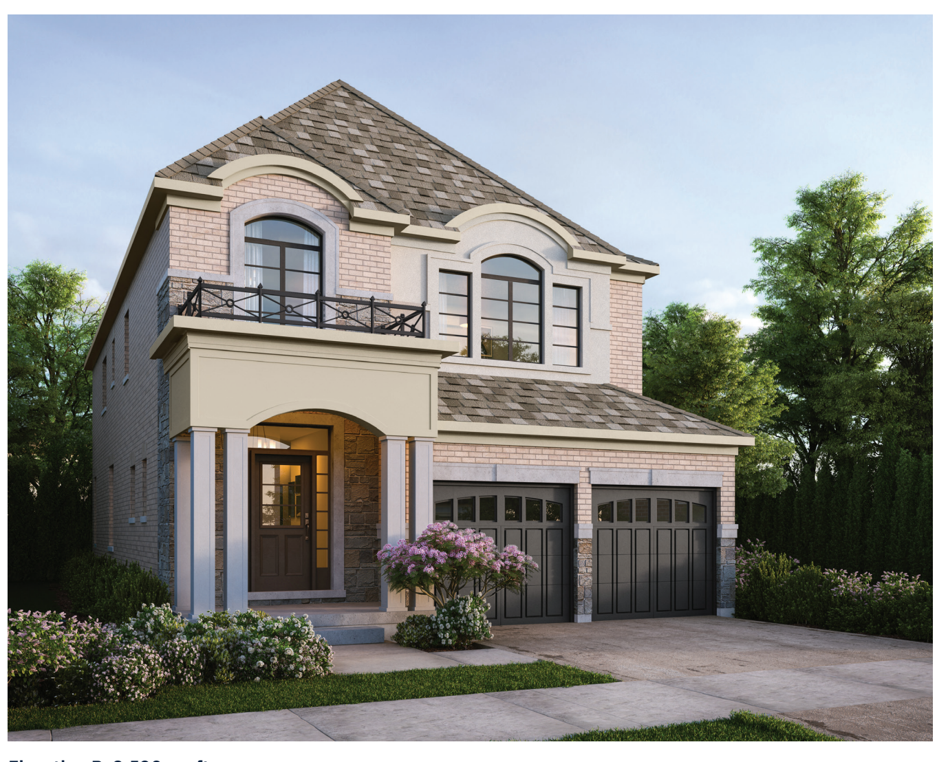
Elevation B 2,590 sq. ft.