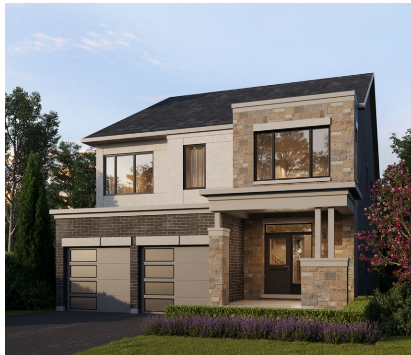
Elevation 'D' 3,205 sq. ft.