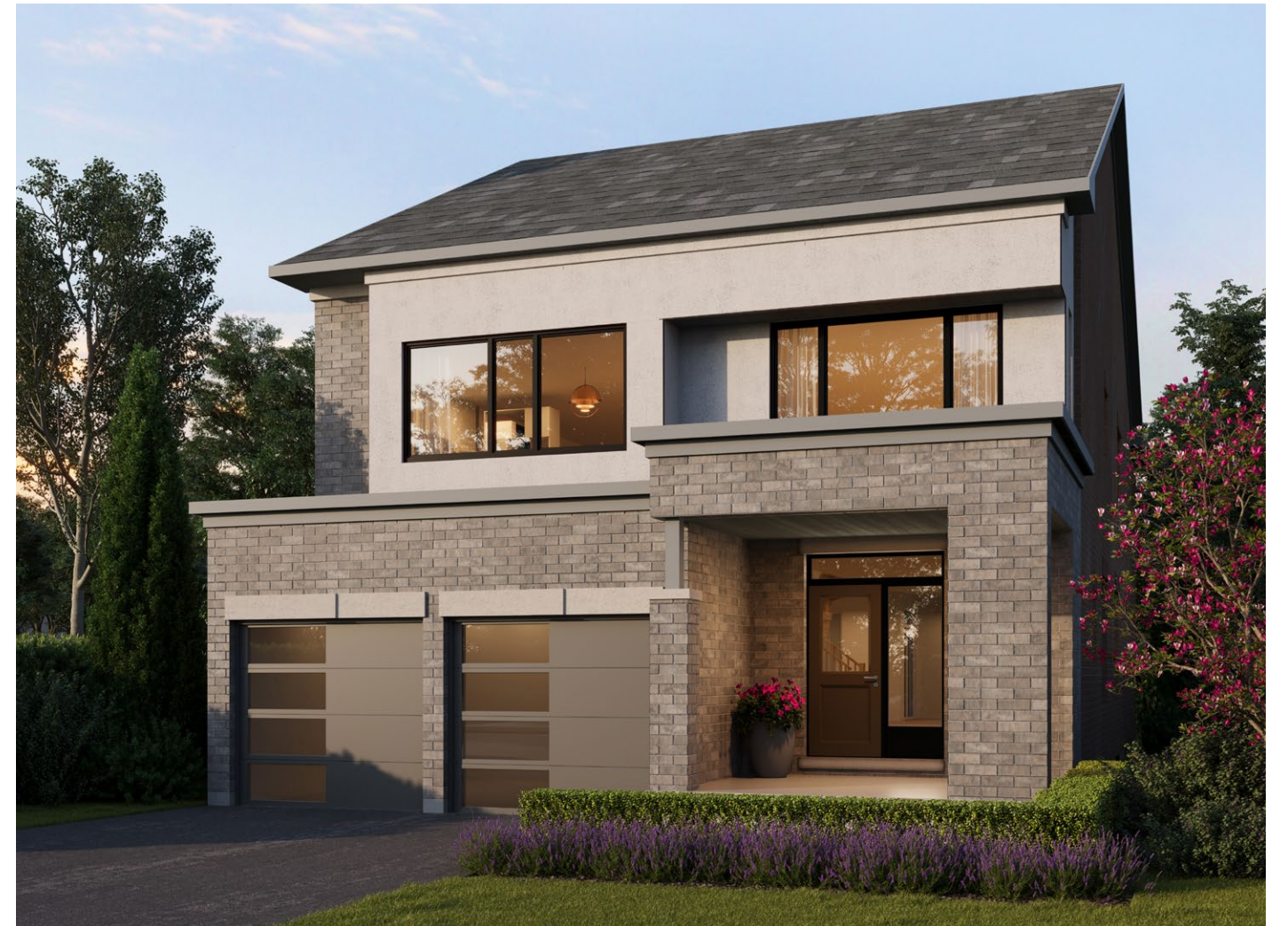
Elevation 'C' 3,185 sq. ft.