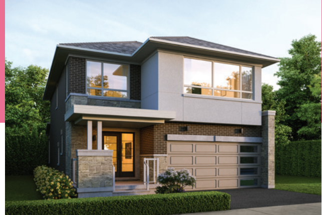
Elevation C - 2,420 sq. ft.