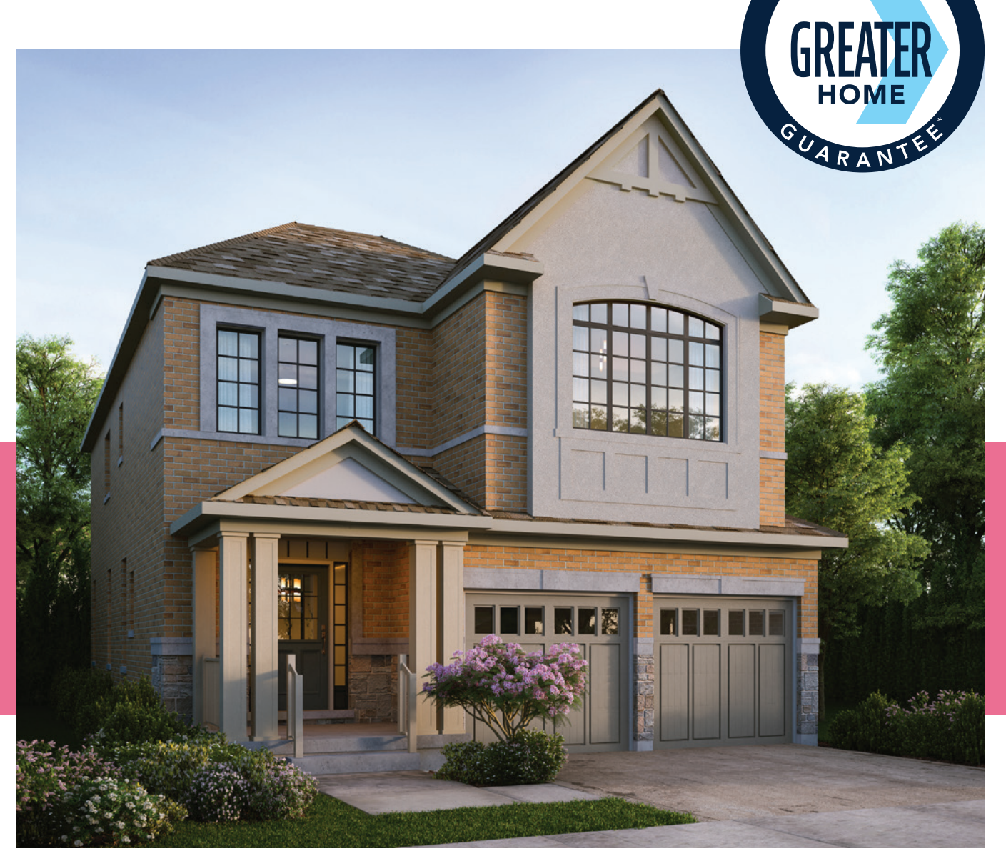
Elevation A - 2,425 sq. ft.