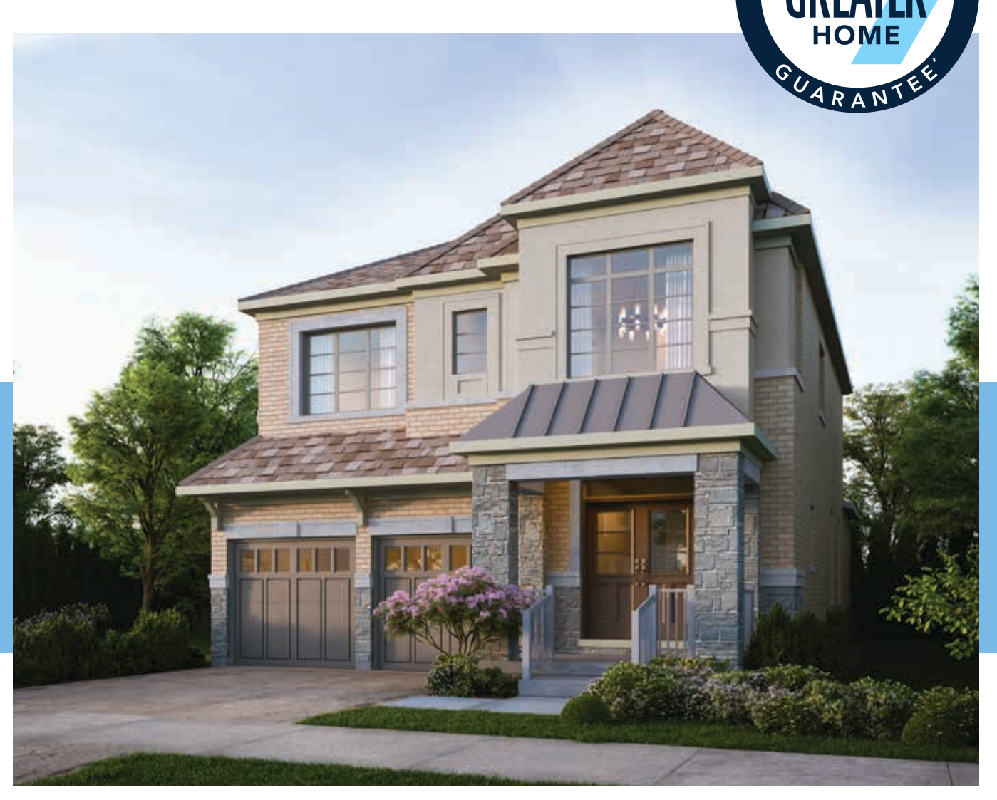
Elevation B - 2,995 sq. ft.