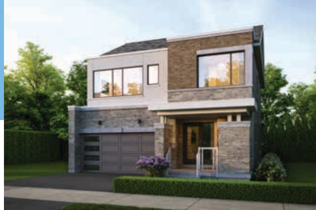
Elevation C - 2,995 sq. ft.